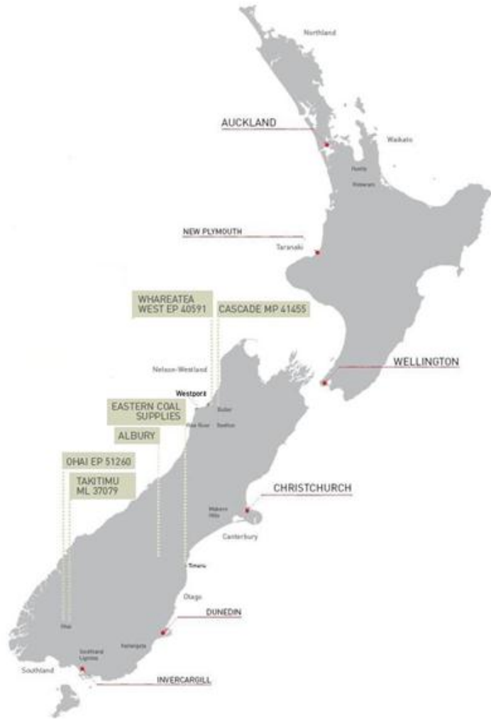
Figure 2 – Denniston Plateau (including Whareatea West Exploration Permit)